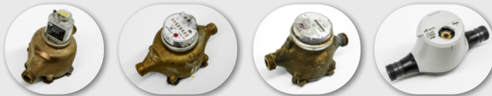
Examples of water meters: